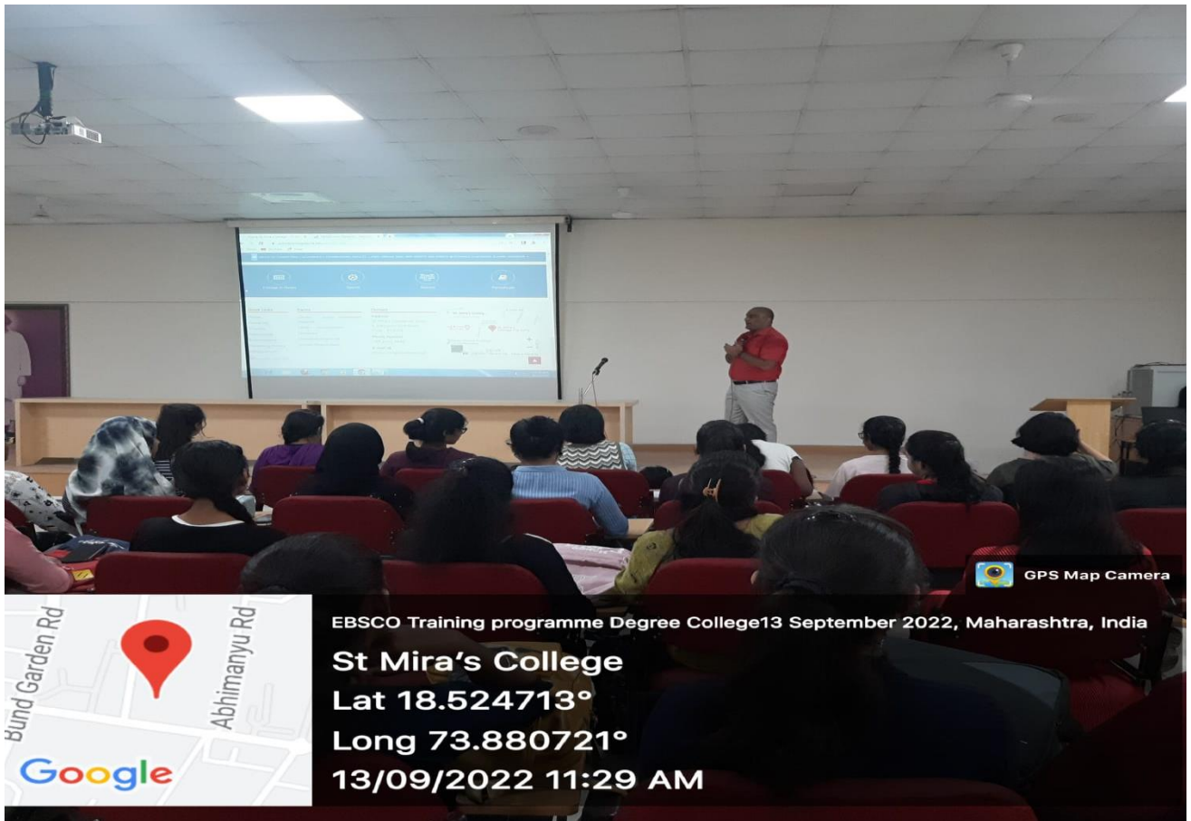
1. Trainer Explaining the Login Credential Request Form

“Choose Right Articles for Assignments and Finding Case Studies with EBSCO Resources”. Dt: 13 th Sept, 2022.