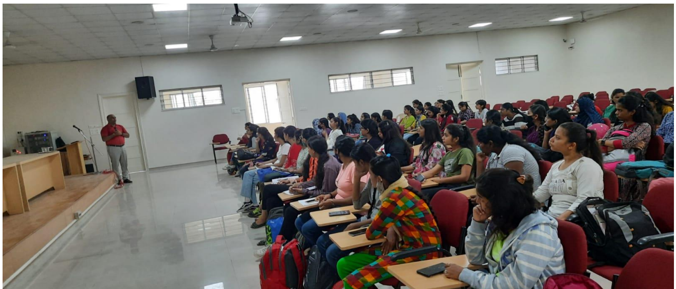
2 Attentive students at the training session